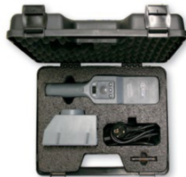
V140 CARRYING CASE WITH BATTERY CHARGER