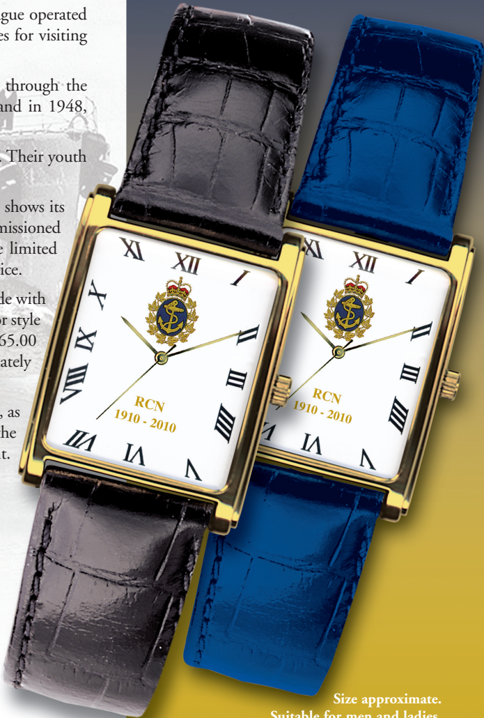
Size approximate. Suitable for men and ladies.