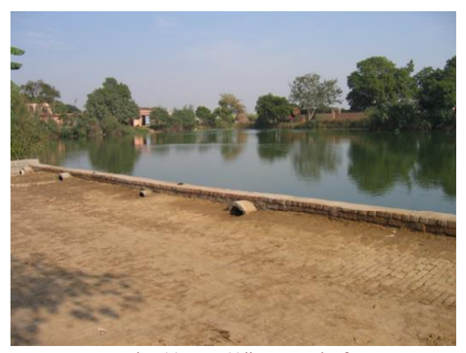
Sunder Nagar: Village pond after

Govt. school has also been renovated now by the Govt. itself