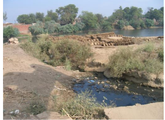
Sunder Nagar: Village pond before

Upgrading of the village pond (retaining wall and landscaping)