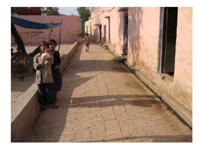
Sunder Nagar: Street after

Dustbins in the streets to collect garbage