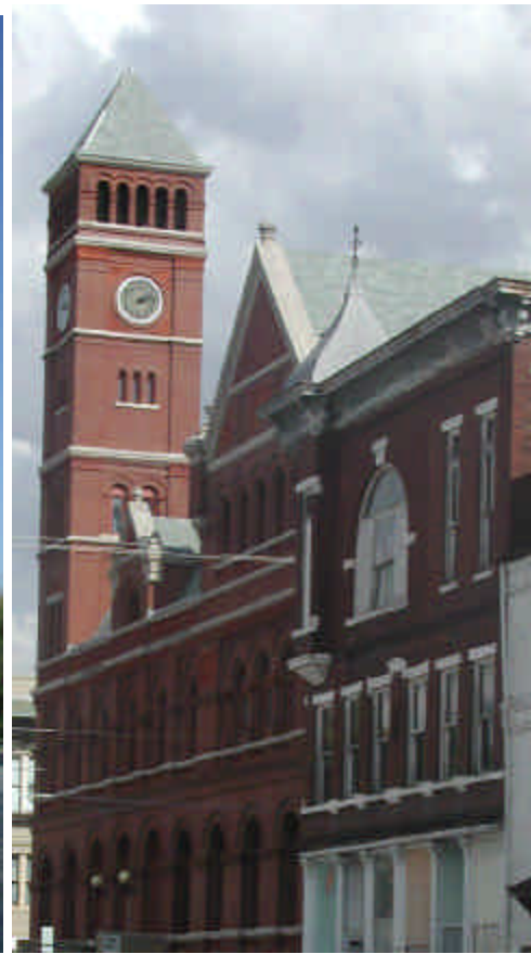
Court house that might have been the University in 1900