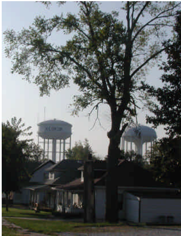
Keokuk water towers seen for 5miles out