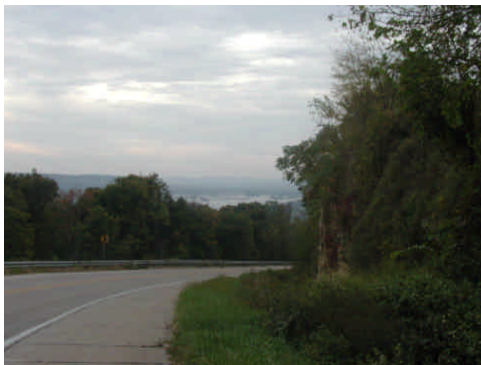
More Mississippi River