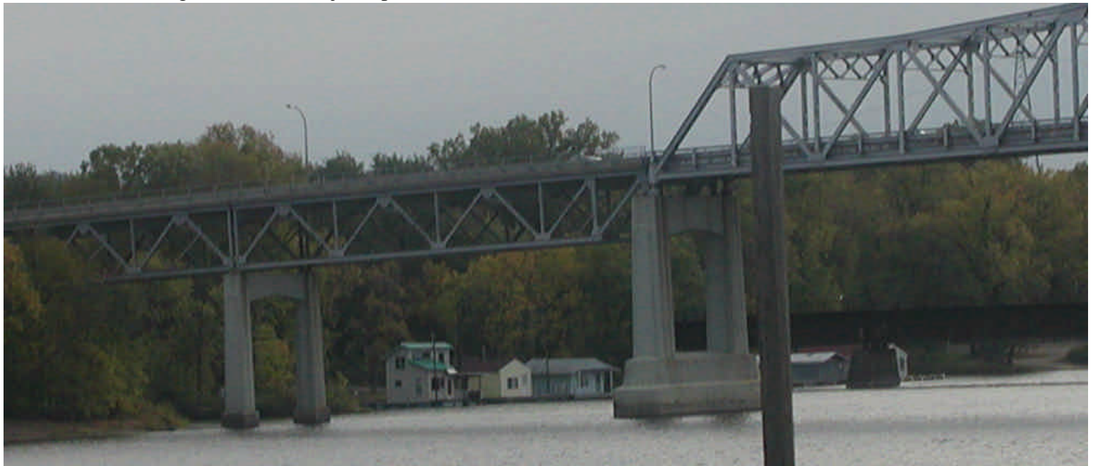
Float houses on the Mississippi River

Overall: Up and off by 8am... not usual but tent is dry. Had to make up 21km from yesterday as we stopped earlier than we anticipated and had not realized it was still 20km to go to the expected campsite. Oh well. Lots of spots where we could see that they had had "land-slides" down hill sides... one spot where a house was taken out between 2 others... lots of huge trees down... just uprooted.