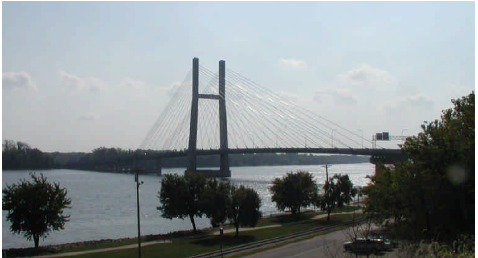
Bridge over the Mississippi River