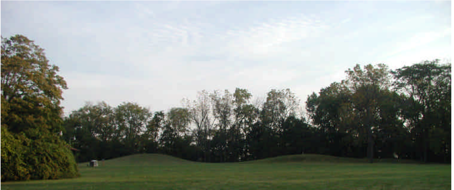
Burial mounds at Toolsboro