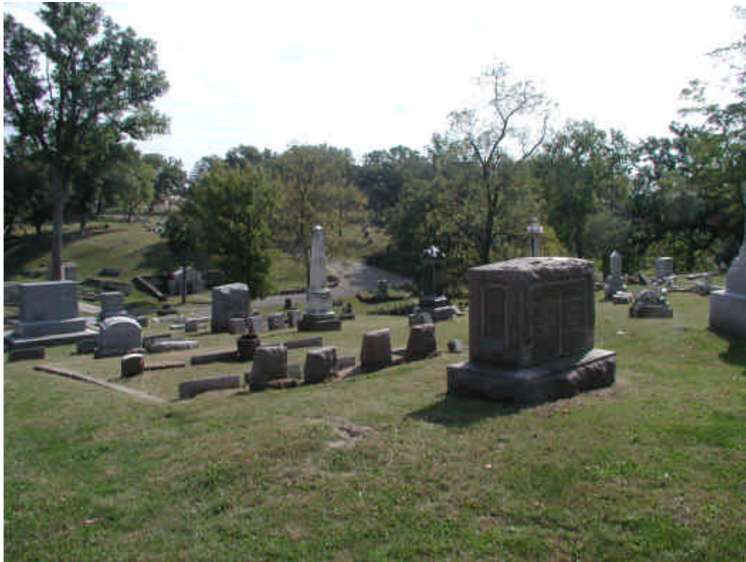
Picture of one part of E section of Oakwood Cemetery Keokuk Iowa