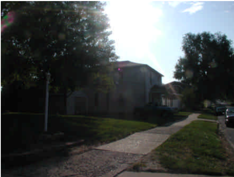
House next door and the tree lined street