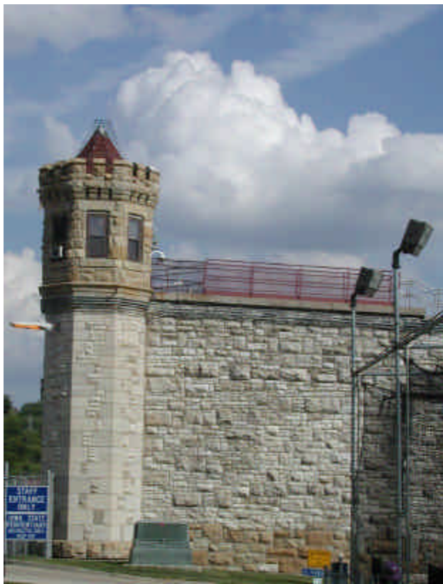
Jail in Burlington... looks like a castle