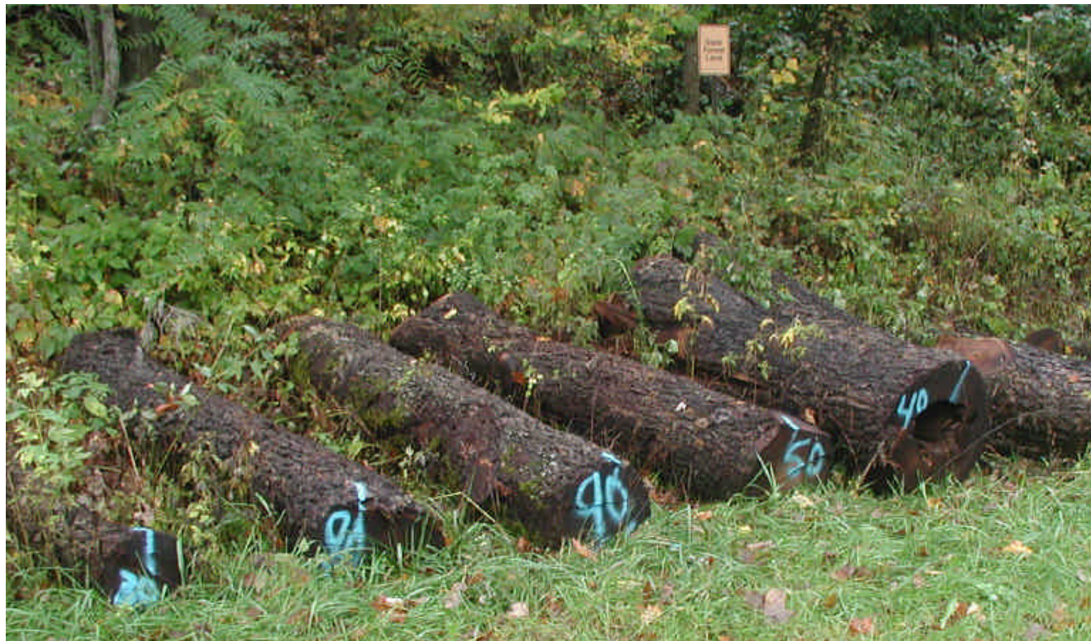
Tree size in YEARS OLD!