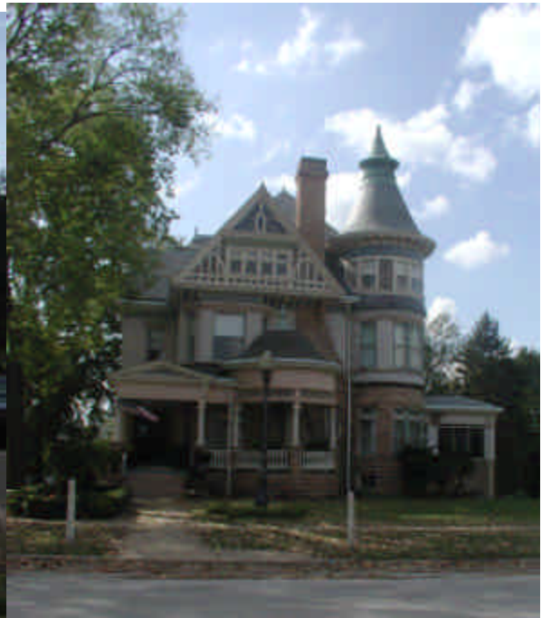
House on Grand Ave