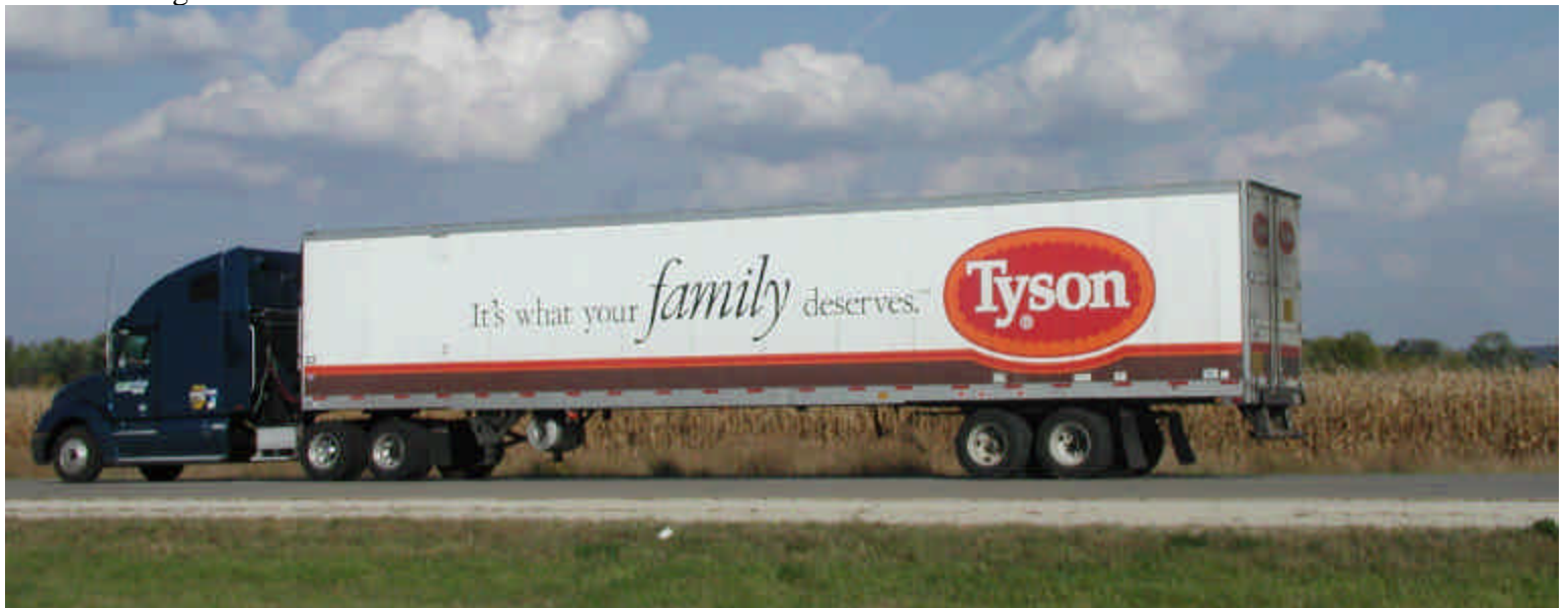
Now that's a statement!