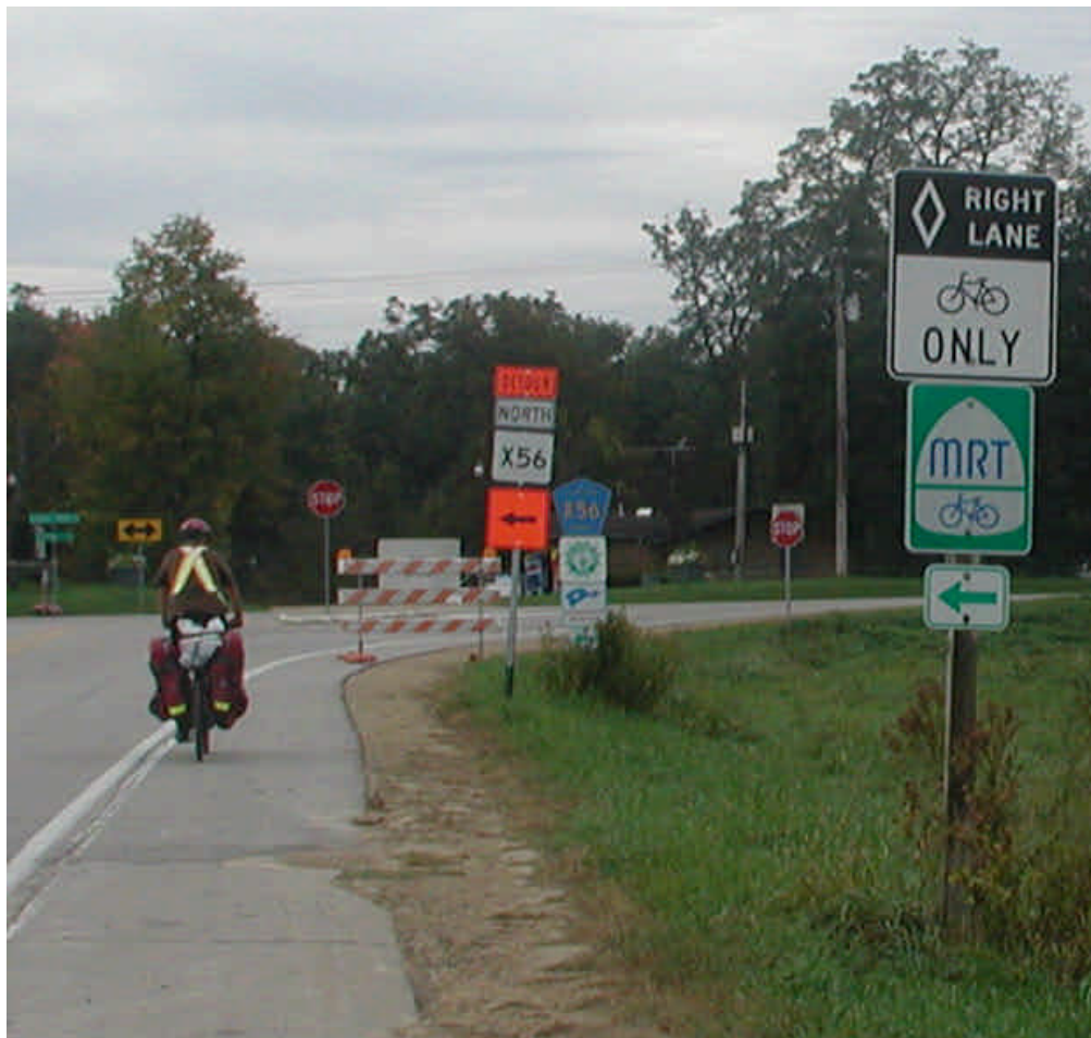
Oh Oh more detours