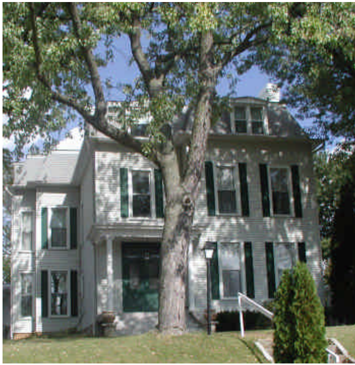
T R Ayers home on Grand Avenue

We went to the library for a map of the grave yard and the info on the internet says they are buried in section E Well we walked for almost 3 hours and we found the other 3 French's which I don't know if they are relations, in a section we are sure is R but in all the areas we think are E we found no French's. It is a very hilly graveyard, very large and not well marked out. Also there are a lot of stones in disrepair so the stones may have been removed if damaged. We were exhausted by the time we walked and walked.