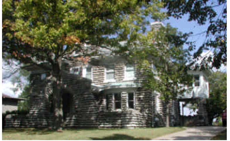
Now that's an ugly house!

We went to the library for a map of the grave yard and the info on the internet says they are buried in section E Well we walked for almost 3 hours and we found the other 3 French's which I don't know if they are relations, in a section we are sure is R but in all the areas we think are E we found no French's. It is a very hilly graveyard, very large and not well marked out. Also there are a lot of stones in disrepair so the stones may have been removed if damaged. We were exhausted by the time we walked and walked.