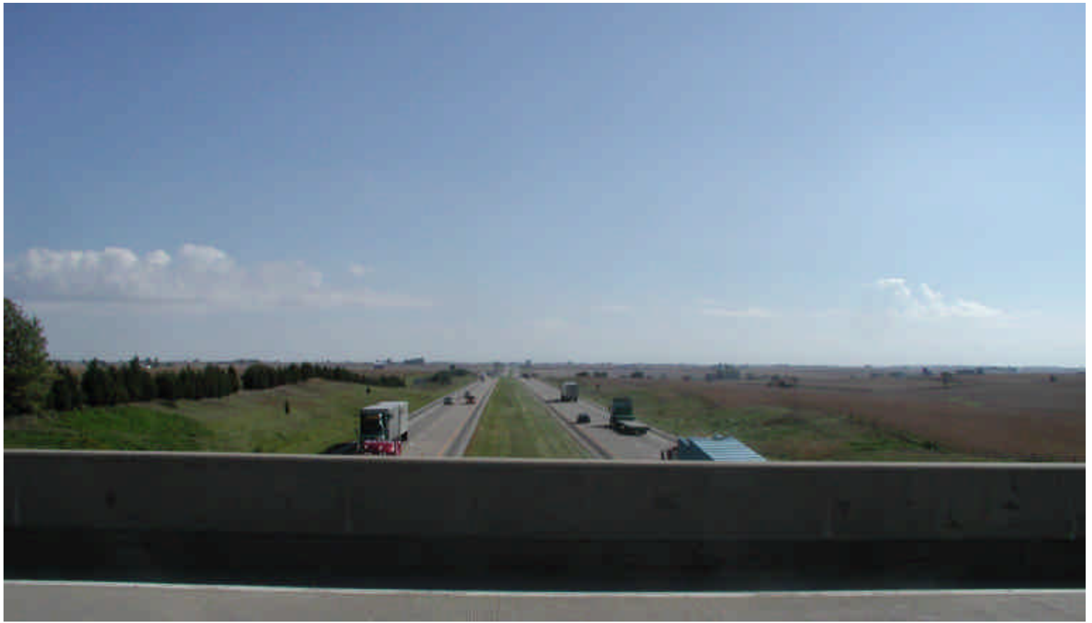
Crossing Hwy I 80 every truck on it's way to New York