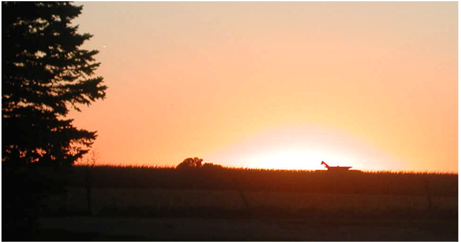
Fall Harvesting into the night