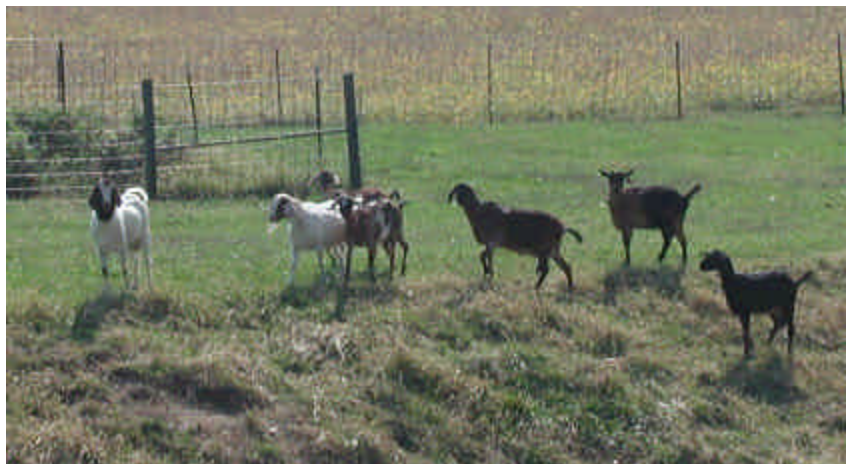
really cute goats along the road.