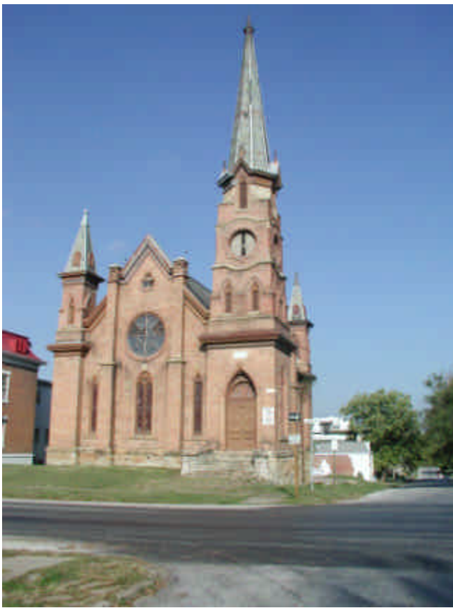
Church around the corner from Morgan St