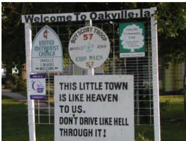
Cute sign for a small town